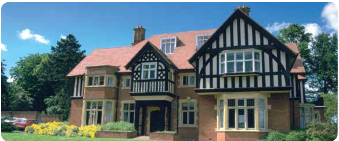
The Birmingham International Academy, Priorsfield, G18