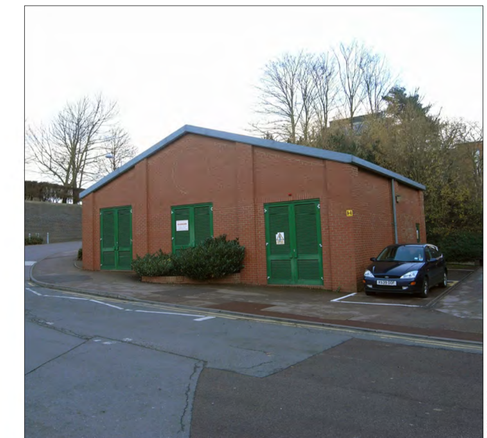
View 6 - Substation 24 (project 12)