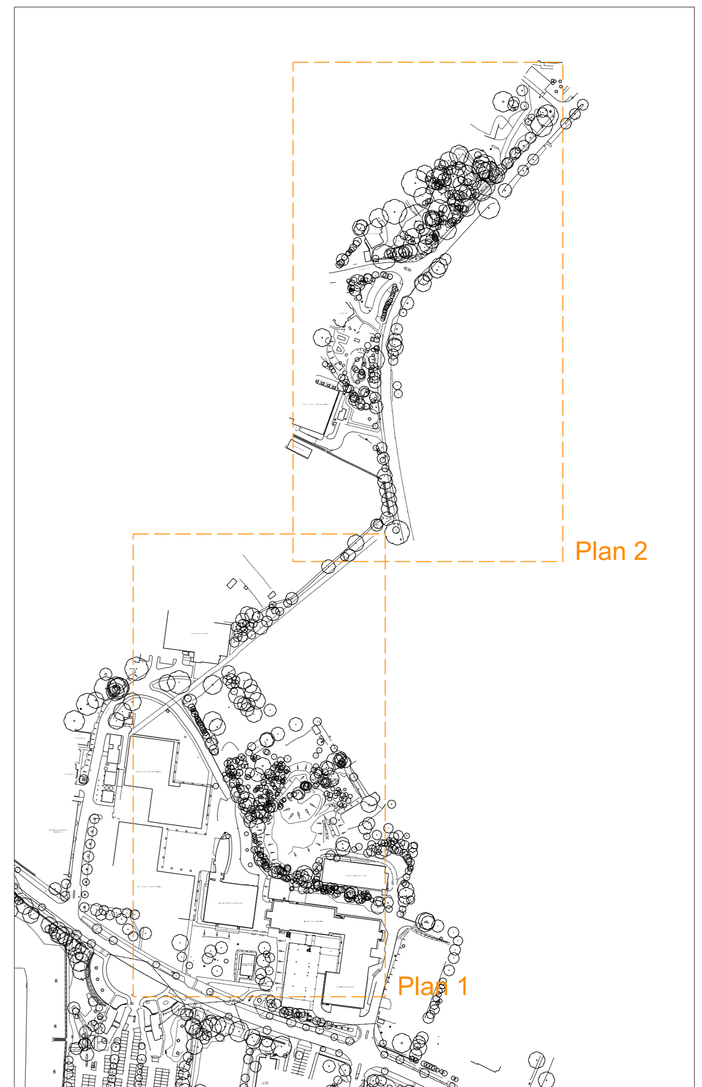
Project 21: Demolitions Block Plan 2 - scale 1:500