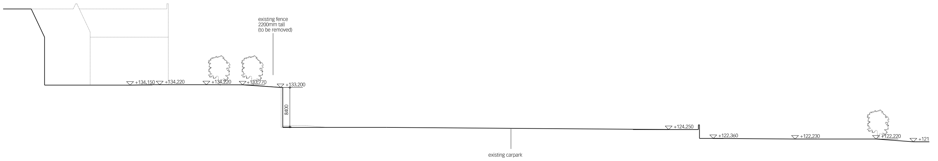
2 existing site section EE