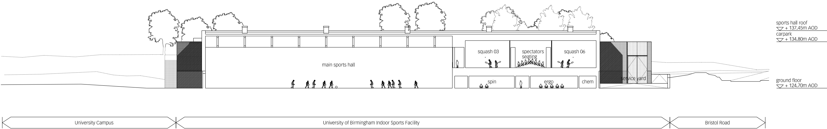
1 section C-C