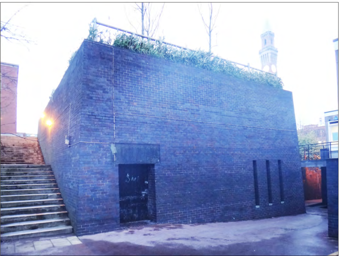
View 10 - Brick Store