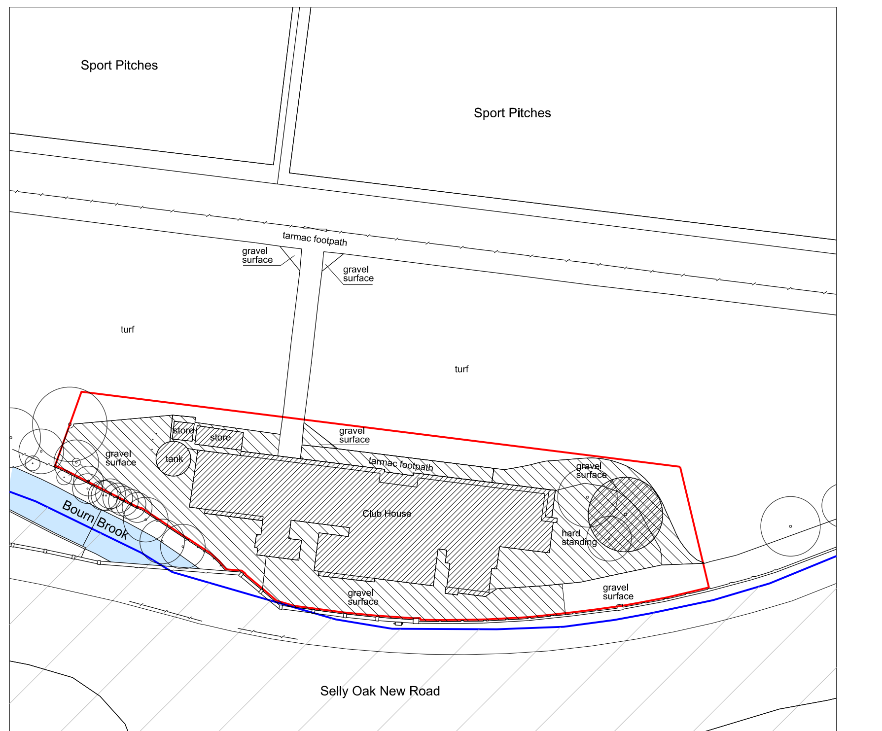
Project 2: Demolitions Block Plan scale 1:500