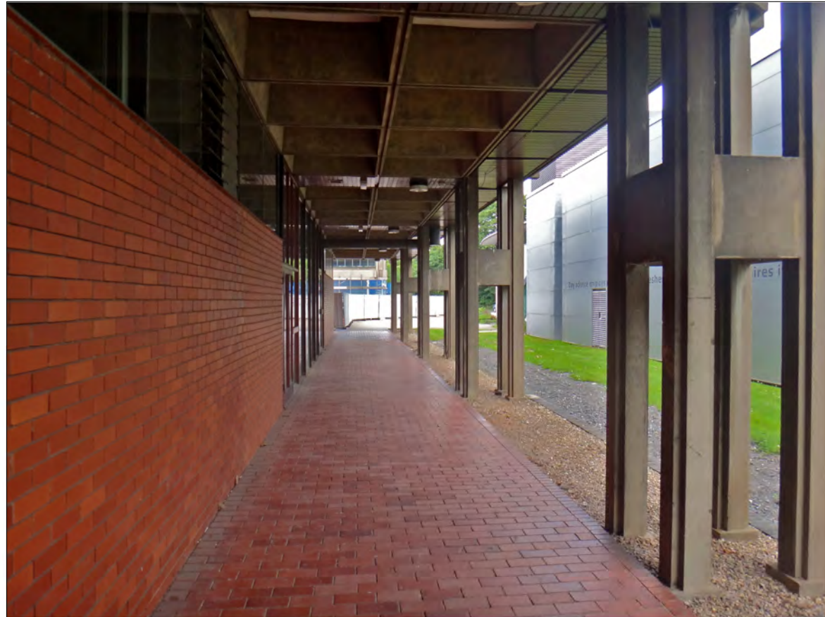
View 1 Colonnade at listed Metallurgy and Materials Building