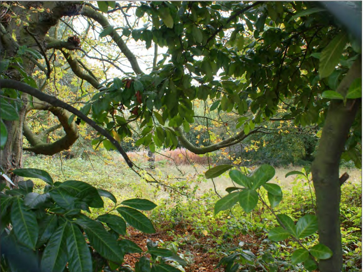
View 3 Garden south of Data Centre