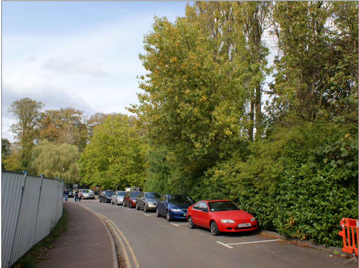
View 2 Towards garden south of Data Centre