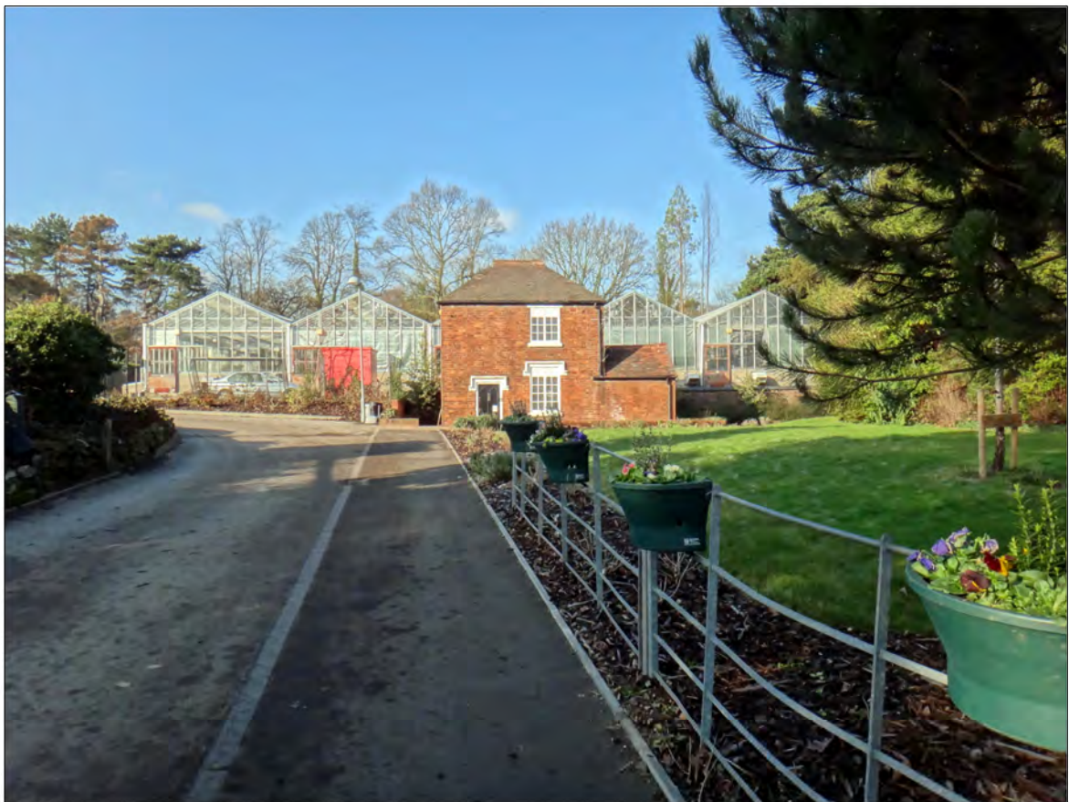
View 6 Listed cottage at Elms Plant Nursery