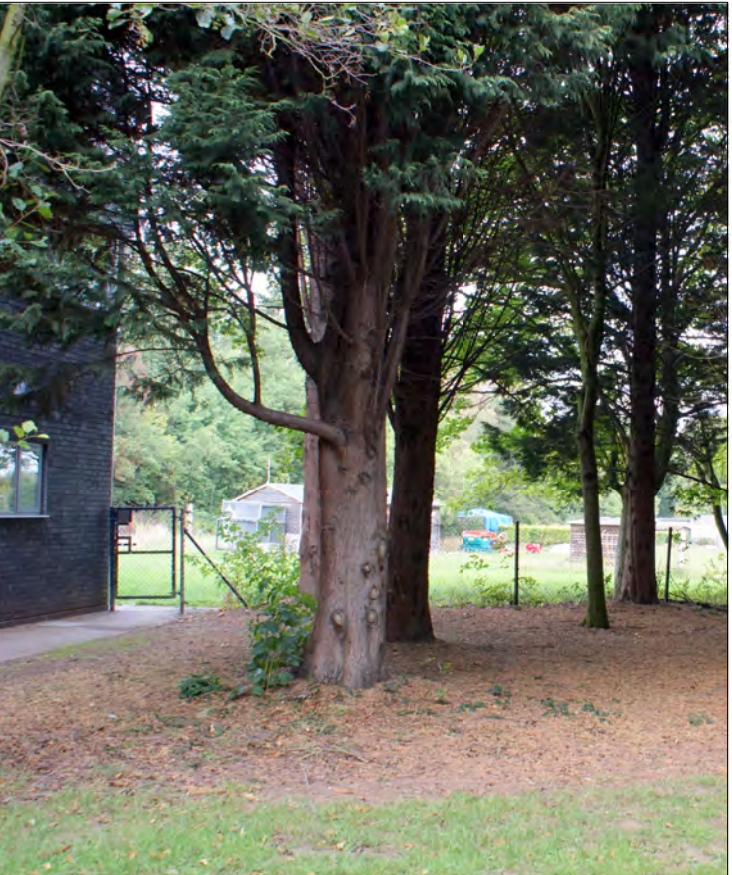
View 4 Data Centre into field beyond