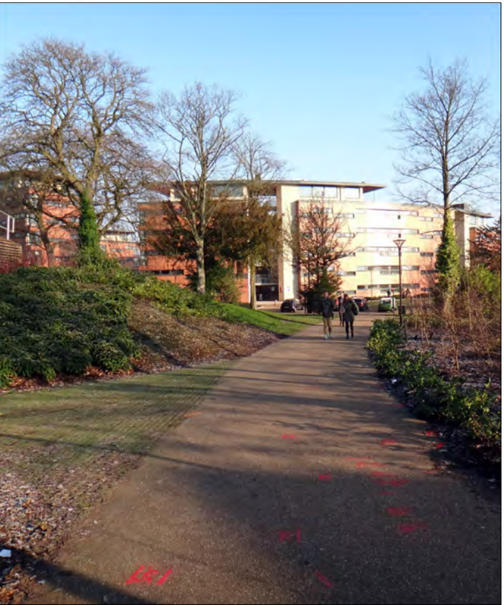
View 12 The Vale