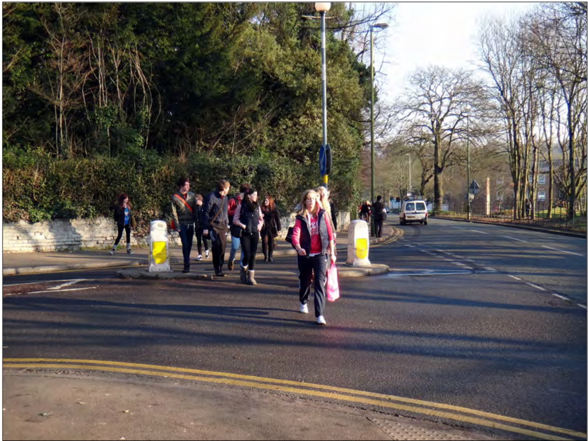
View 10 Somerset Road looking towards Park Grange