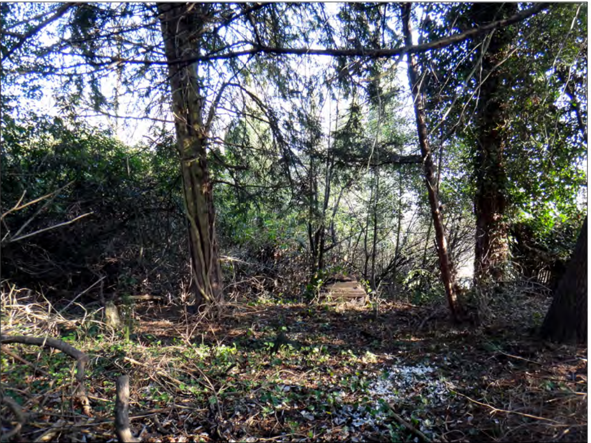
View 11 Park Grange Garden