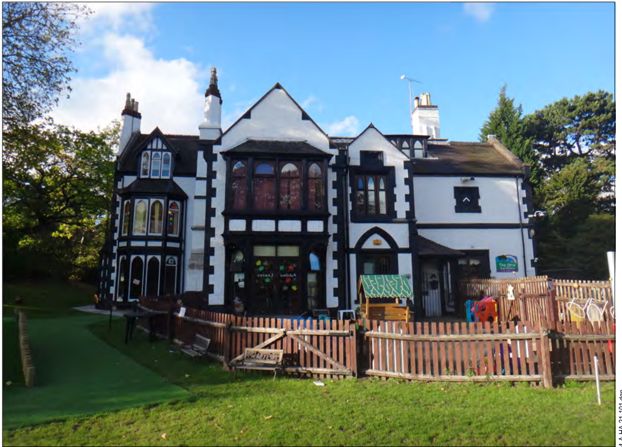
View 13 Listed Elms Children's Nursery