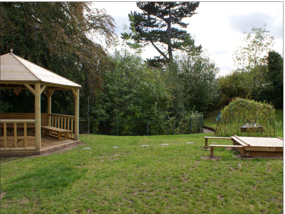
View 7 Elms Children's Nursery garden and fenced pond