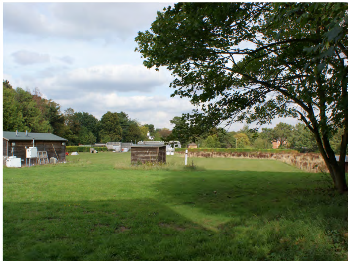
View 5 Towards Weather Station