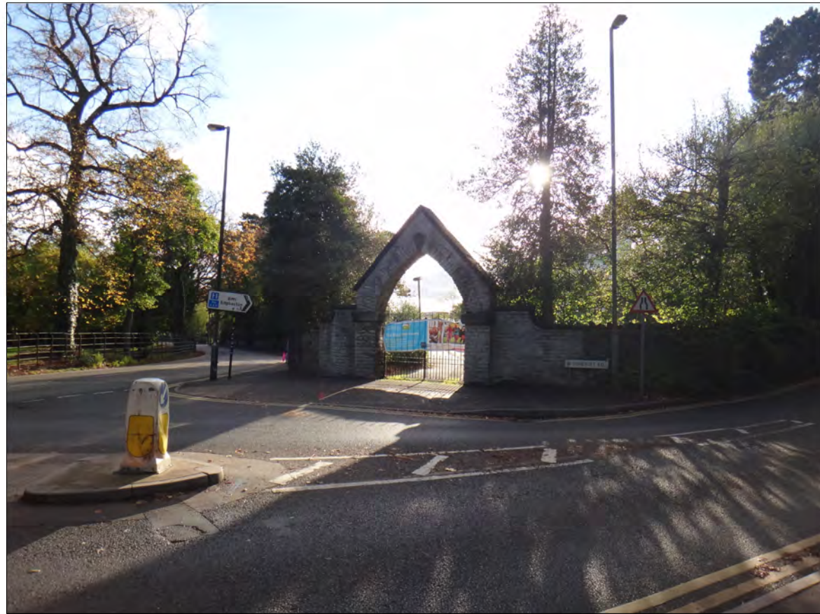
View 9 Somerset Road looking towards Elms Children's Nursery