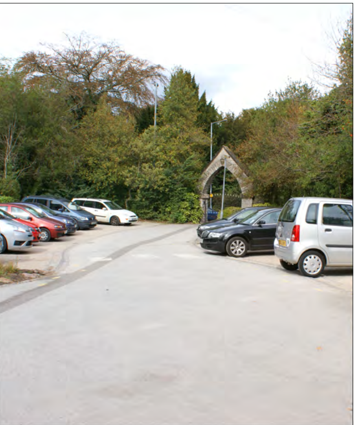
View 8 Elms Children's Nursery car park