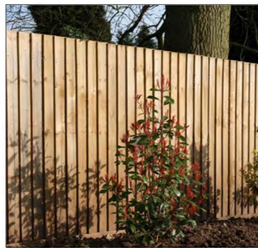
Project 21: 1.8m tall full board timber fence to screen the route from the Nursery garden and car park to be enhanced with planting