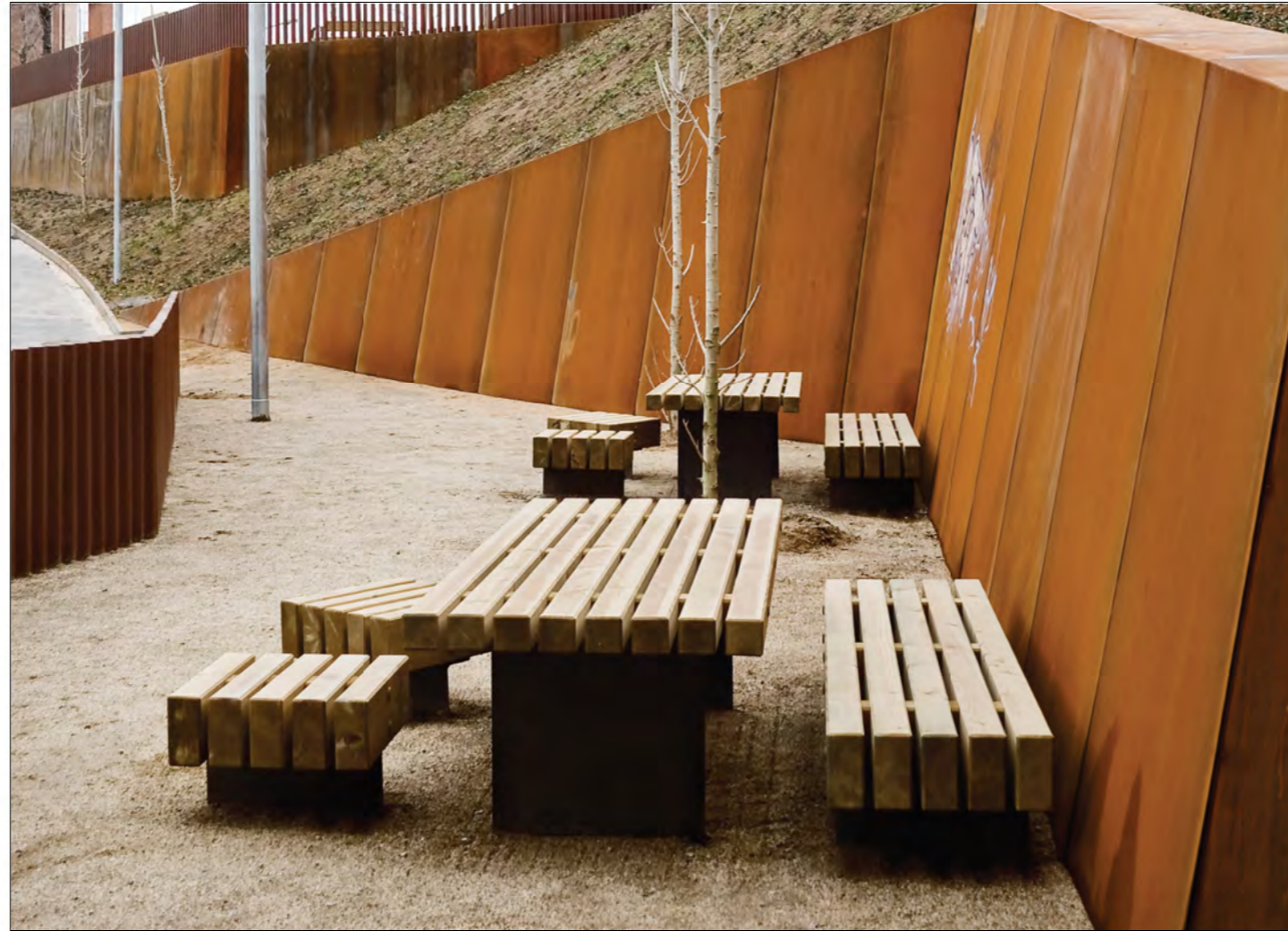
Project 21: Bench - Escofet Tramet bench and seat