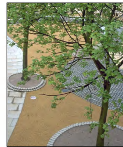
Project 21: Bonded gravel surface to path