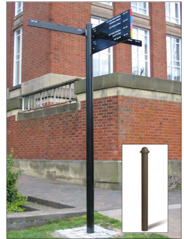
University of Birmingham standard signage