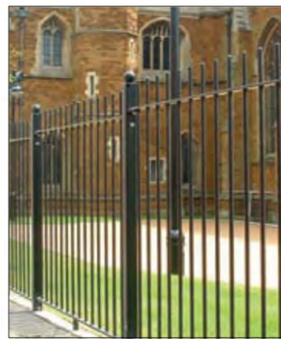
Project 21: Steel fence on boundary of Park Grange