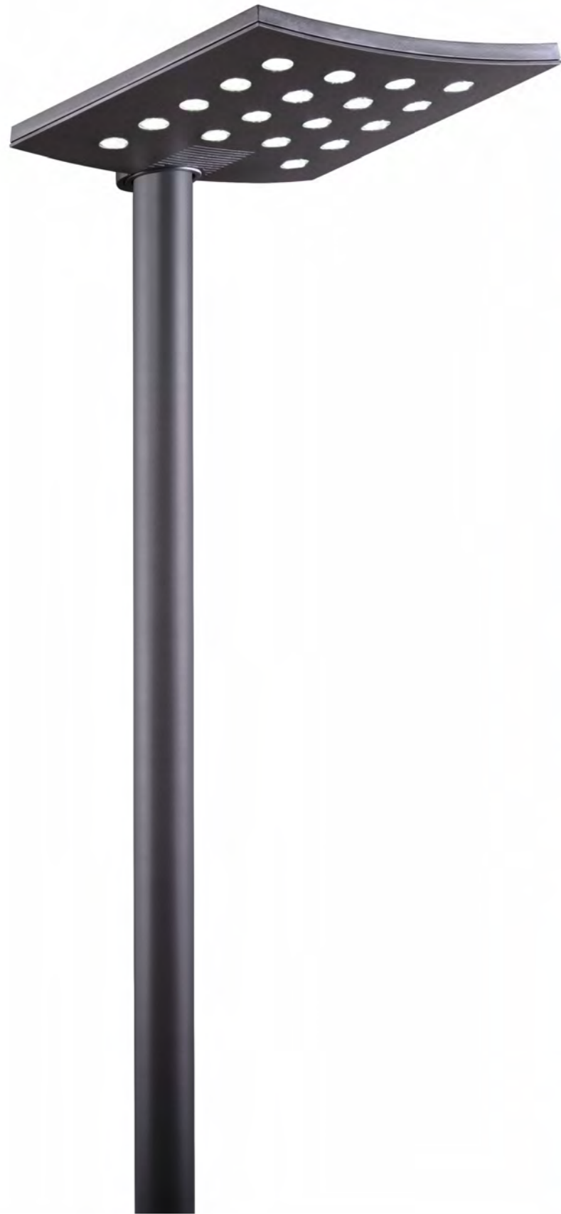
Project 21: Light standards - Indal WRTL Stela Square