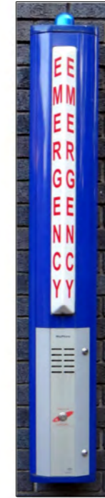
Panic Button Point