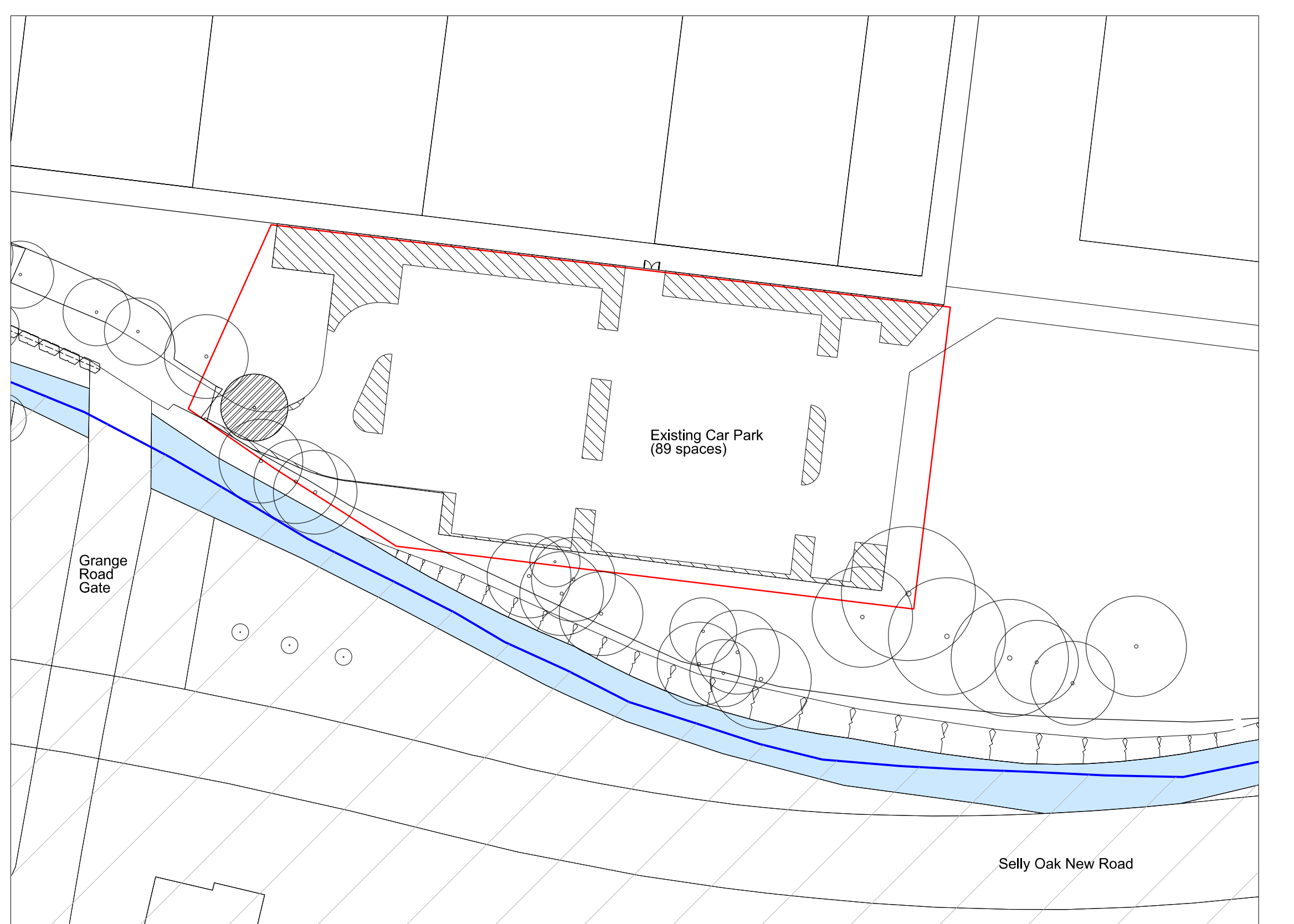
Project 3: Demolitions Block Plan - scale 1:500