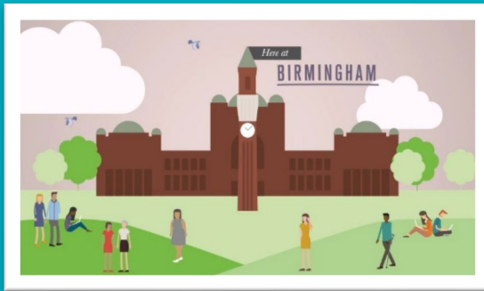
Camera pans down to new scene