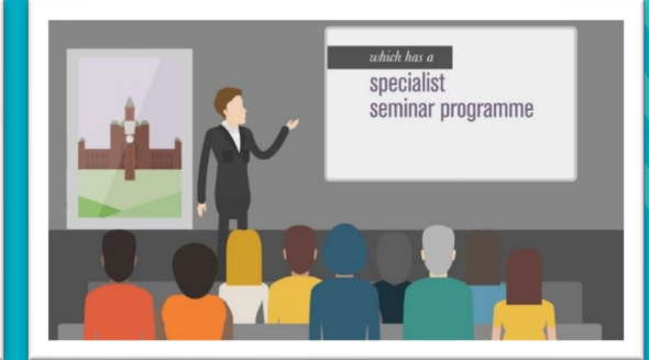
Wipe to new scene