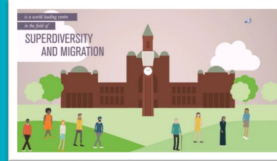
Zooms back in to picture frame