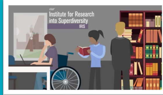
Camera zooms out from picture frame