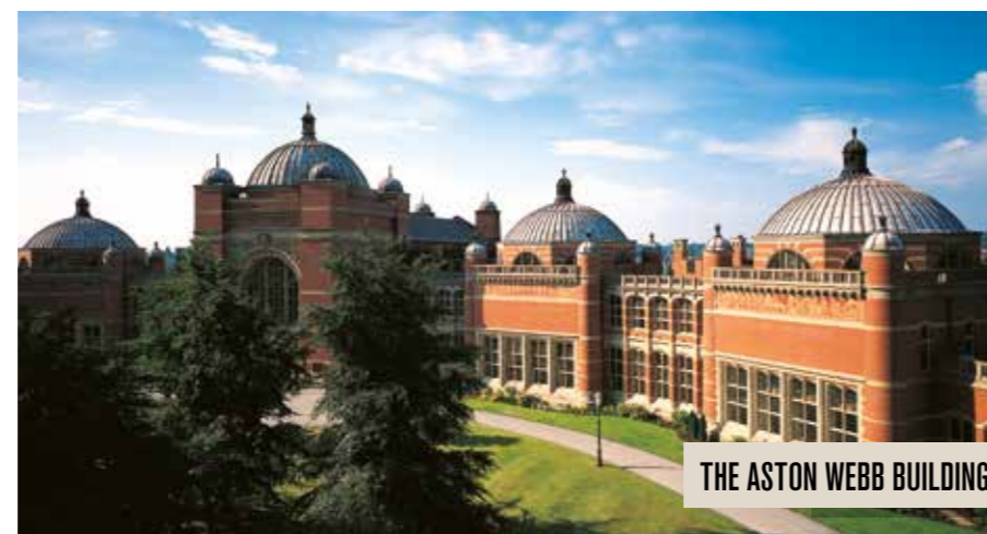
THE ASTON WEBB BUILDING

Students who attend a preessional course DO NOT take IELTS at the end of the course.